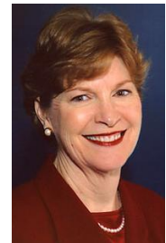
Honoree US Senator-elect Jeanne Shaheen

U.S. Senator-elect and former Governor Jeanne Shaheen will be honored for having signed the law creating the official Martin Luther King, Jr. Holiday in New Hampshire.