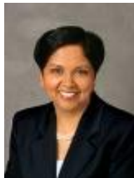
Honoree Ms. Indra Nooyi Chairman & CEO PepsiCo. Inc.